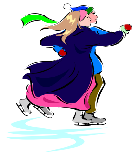
We are on the move!

Take a moment to look at it! Watch for updates of upcoming events like; classes, parties and customer appreciation events and much more!