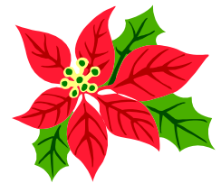
Happy Healthy Holidays!

Long hair bath & dry - $25 per dog, will provide shampoo if you wish.