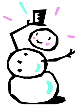
Time to celebrate